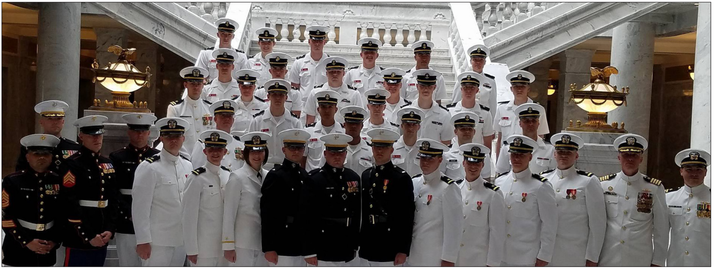
THE BATTALION POSES ON THE STEPS OF THE UTAH CAPITOL BUILDING FOLLOWING THE COMMISSIONING CEREMONY.