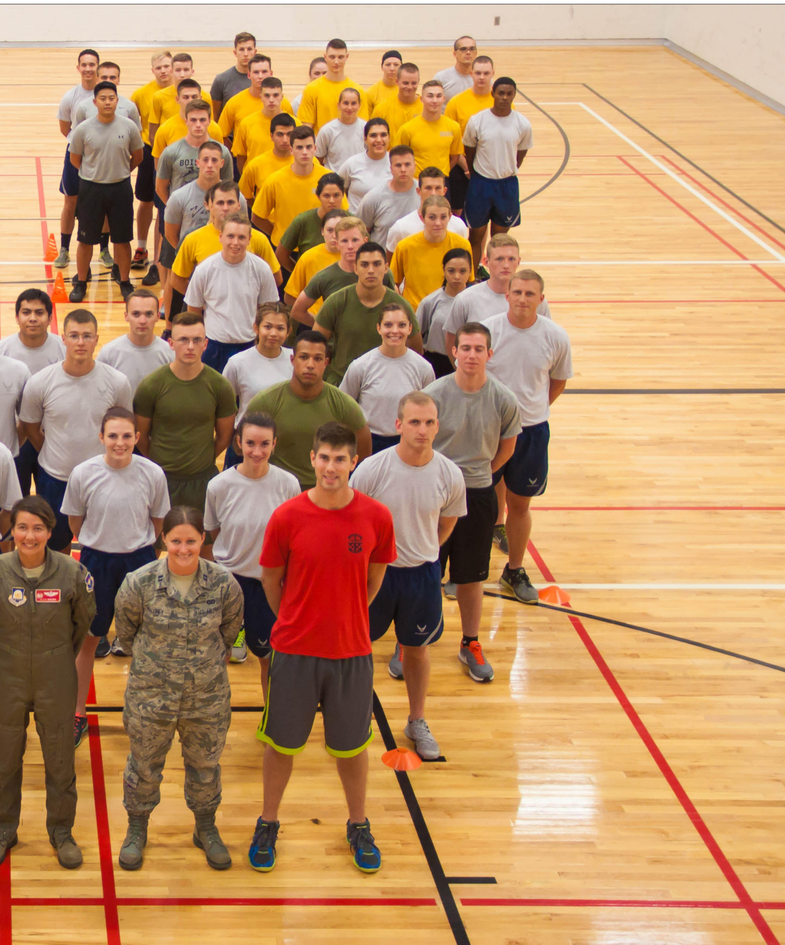
BUILD CAMARADERIE AND ESPRIT DE CORPS AMONG THE NAVAL AND AIR FORCE SERVICES.