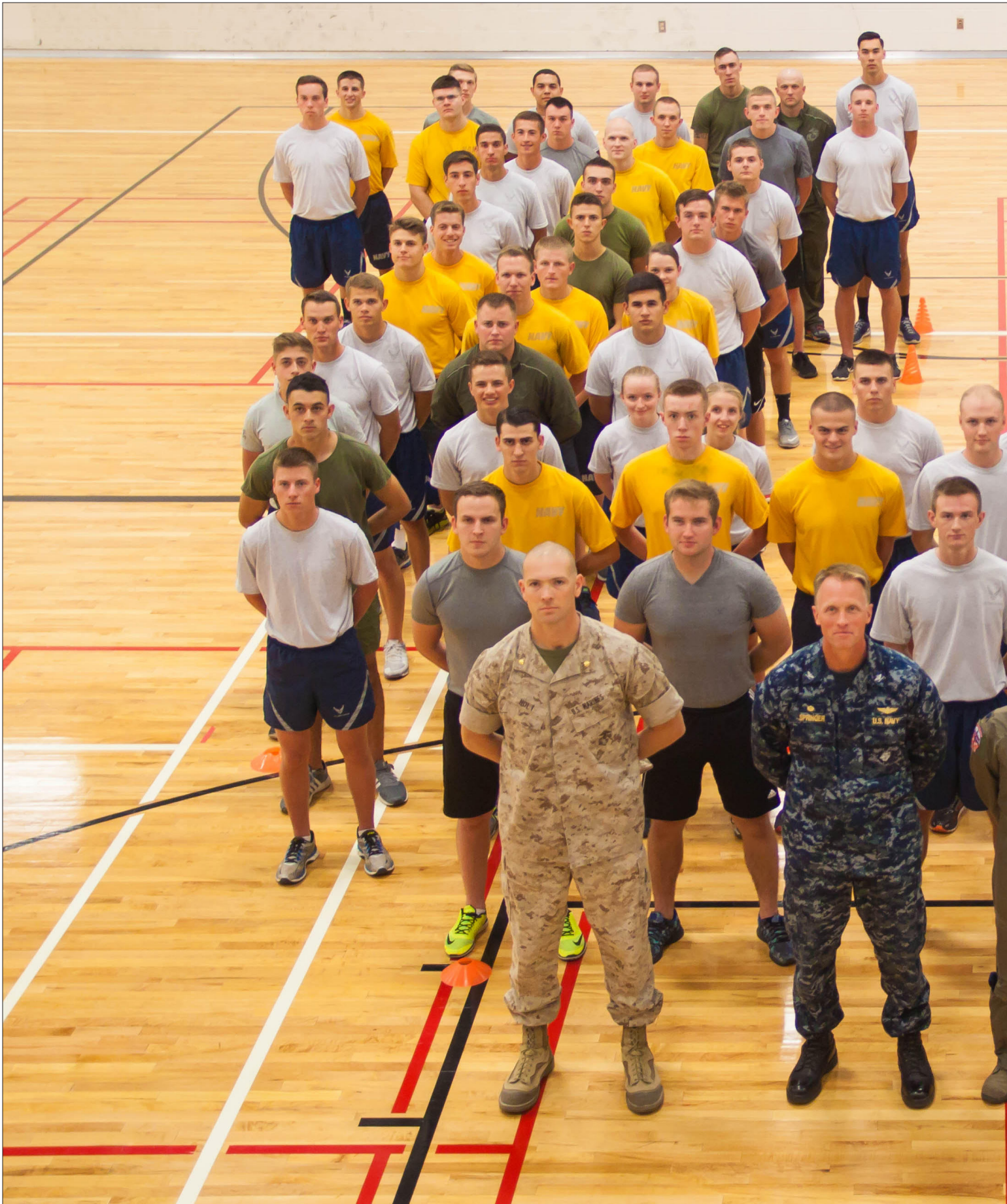
THIS YEAR, THE UNIVERSITY OF UTAH NROTC AND AFROTC GATHERED TO PARTICIPATE IN JOINT DODGEBALL AND BASKETBALL GAMES TO B