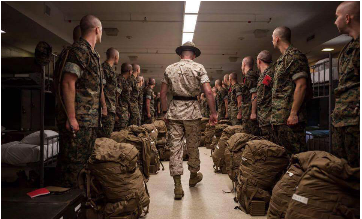
LIMA CO. 3RD PLT ARE INTRODUCED TO THEIR SGT. INSTRUCTORS ON PICK UP DAY AT OFFICER CANDIDATES SCHOOL.