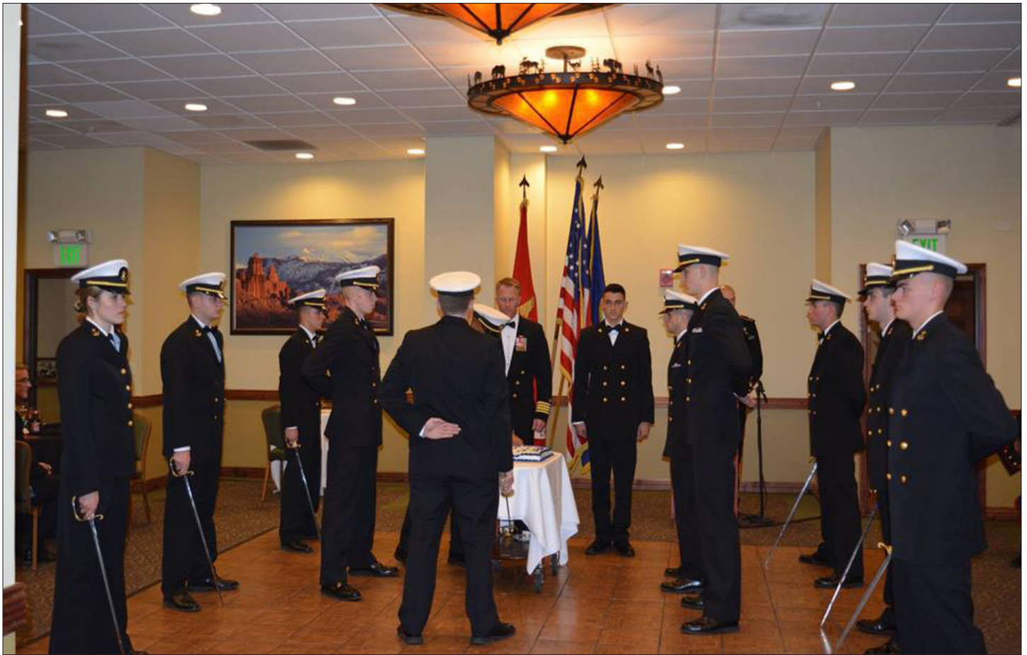
MIDSHIPMEN AND STAFF PERFORM THE CAKE CUTTING CEREMONY DURING THE 2016 NAVY AND MARINE CORPS BALL.