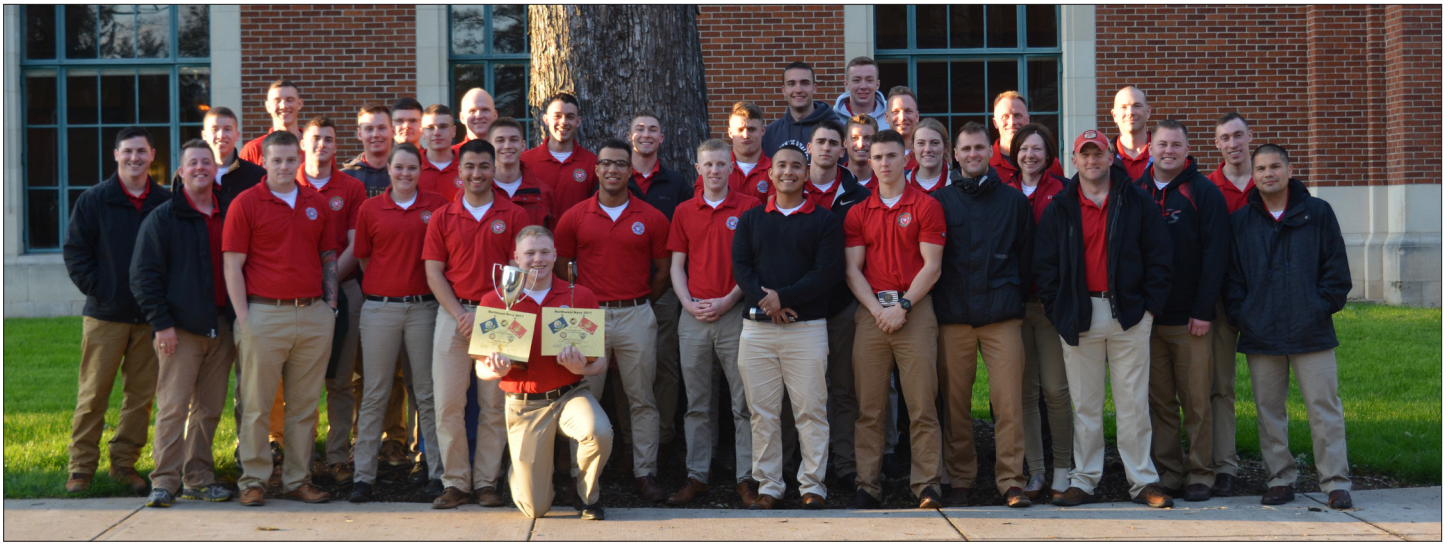
UNIVERSITY OF UTAH PARTICIPANTS CELEBRATE AFTER COMPETING AT NORTHWEST NAVY IN APRIL